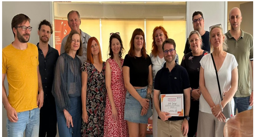
Project Management Teams

A key output of the TPMs are to ensure our administration, compliance, and outputs are working to budget & timeline. As we work towards the closure deadline, the management cooperation in relation to documentation is critical.