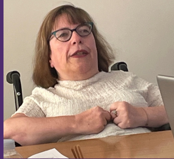
Presentation by Job Coaching Team