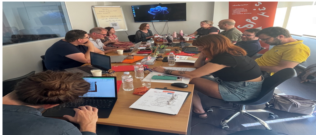
Transnational Project Meeting in Koispe Office in Athens