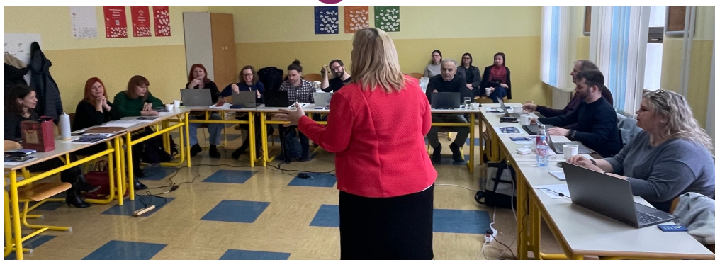
Partners Transnational Project Planning Meeting – Hosted by UPI, Zalec, Slovenia

The Transnational Project Management meetings are essential for effective collaboration among our EU partners. This meeting provided a platform for discussing project objectives, sharing ongoing best practices, and addressing any challenges that have arisen. By bringing together representatives, these sessions ensured that everyone is aligned on the project goals and timelines. In addition to our digital meetings, face-to-face interactions enhance communication, build trust, and encourage a sense of shared purpose, which is crucial for the successful implementation of the project.