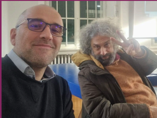
Meeting our colleagues we have only met via zoom, is always rewarding