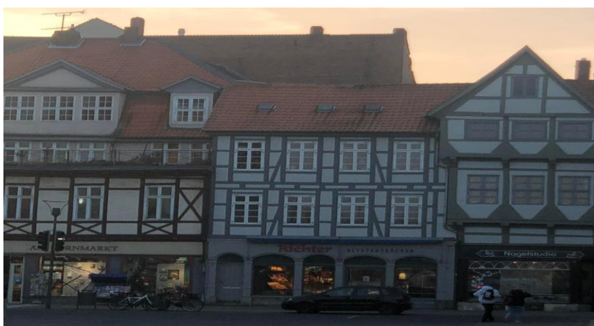
• Wolfenbuttel town

The Partnership held the inaugural meeting of the Digi-Lance4SE Project in Wolfenbuttel in January 2022.